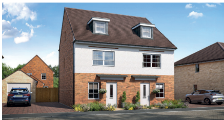
The Kingsville - 3 bedroom semi-detached