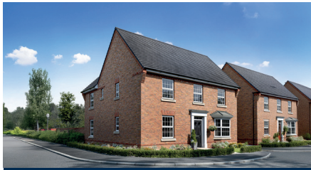
The Avondale - 4 bedroom detached

A sneak peak of the Show Homes available to view