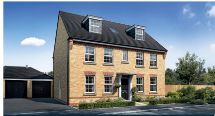
The Buckingham - 5 bedroom detached