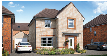
The Kingsley - 4 bedroom detached