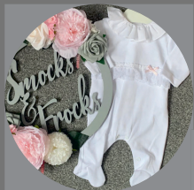
Cotton Babygrow with Lace Detail - £16.00

Baby & Childrens Clothing - Personalisation Available Use code "villagescene" for 25% off your first online order