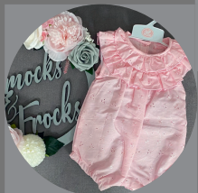
Girls Romper - £14.00