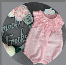
Girls Romper - £14.00