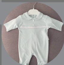
Babygrow with Button and Ribbon Detail - £15.00

Facebook - Smocks and Frocks Instagram - smocksandfrocks1