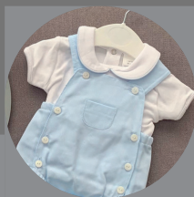
Boys Cotton Dungaree Set - £25.00