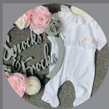
Cotton Babygrow with Lace Detail - £16.00

Baby & Childrens Clothing - Personalisation Available Use code "villagescene" for 25% off your first online order