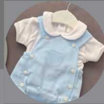
Boys Cotton Dungaree Set - £25.00