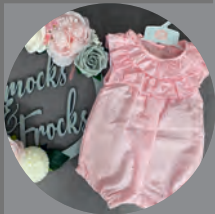
Girls Romper - £14.00