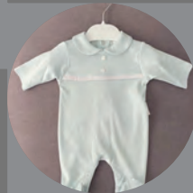
Babygrow with Button and Ribbon Detail - £15.00

Facebook - Smocks and Frocks Instagram - smocksandfrocks1