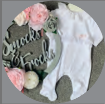
Cotton Babygrow with Lace Detail - £16.00

Baby & Childrens Clothing - Personalisation Available Use code "villagescene" for 25% off your first online order